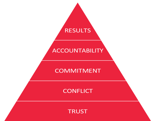
The Five Behaviors Model

The experience is completed through a training session, led by a trained Five Behaviors expert. This session includes a walkthrough of the Personal Development profile, breakout activities, and group discussion.